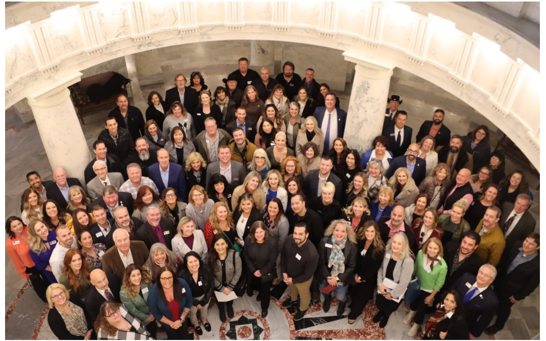
REALTORS® from all over the state met with officials from the executive, judicial, and legislative branches of state government on February 2, 2023.

Locally, Boise Regional REALTORS® (BRR) ensures the voices of REALTORS® and homeowners are heard when decisions are being made at city councils and county commissions throughout the region. If you would like to find out how you can personally get involved in advocating for private property rights, visit propertyownersalliance.org .