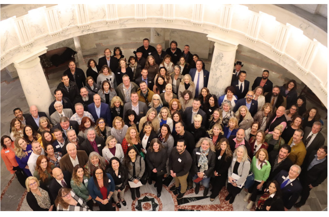
REALTORS® from all over the state met with officials from the executive, judicial, and legislative branches of state government on February 2, 2023.

To do this, REALTORS® engage with elected officials at the local, state, and national levels, constantly watching for legislation that could impact private property rights, homeownership, and real estate transactions.