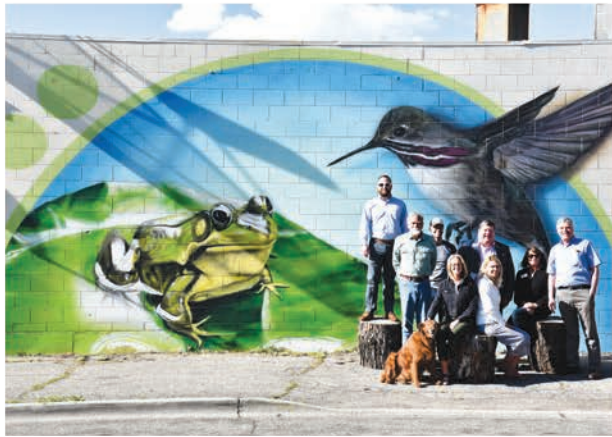
REALTORS® partnered with the Depot Bench Neighborhood Association and Sector 17 to create a public gathering place and mural, representing the coming together of old and new to create a more vibrant and diverse community.

REALTORS® engage with elected officials at local, state, and national levels, constantly watching for legislation that could impact private property rights, homeownership, and real estate transactions. Locally, Boise Regional REALTORS® (BRR) makes sure the voices of REALTORS® and homeowners are considered when decisions are being made at city council and county commission meetings throughout Ada, Elmore, and Gem counties.