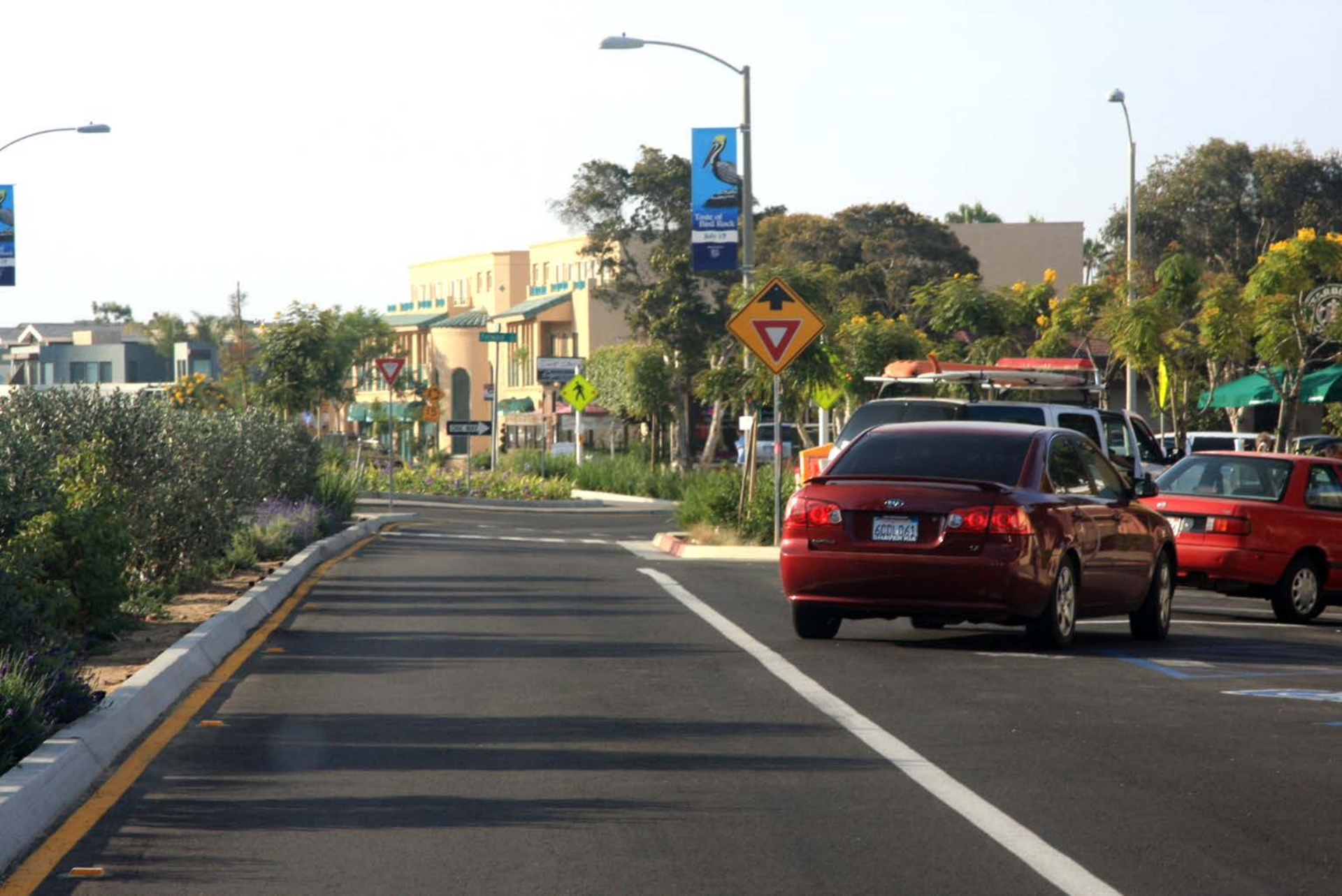
LaJolla Boulevard, Birdrock (U.S. Coastal 101), handles 23,000 ADT