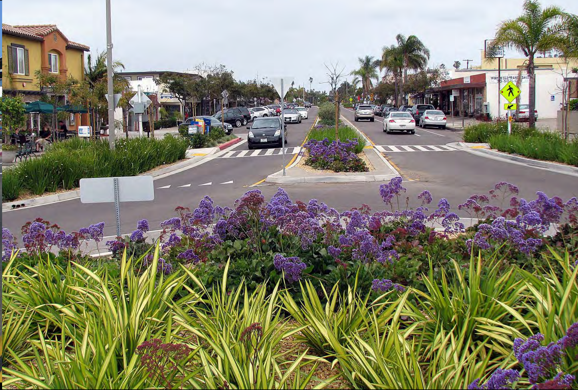
LaJolla Boulevard, Birdrock (U.S. Coastal 101), handles 23,000 ADT