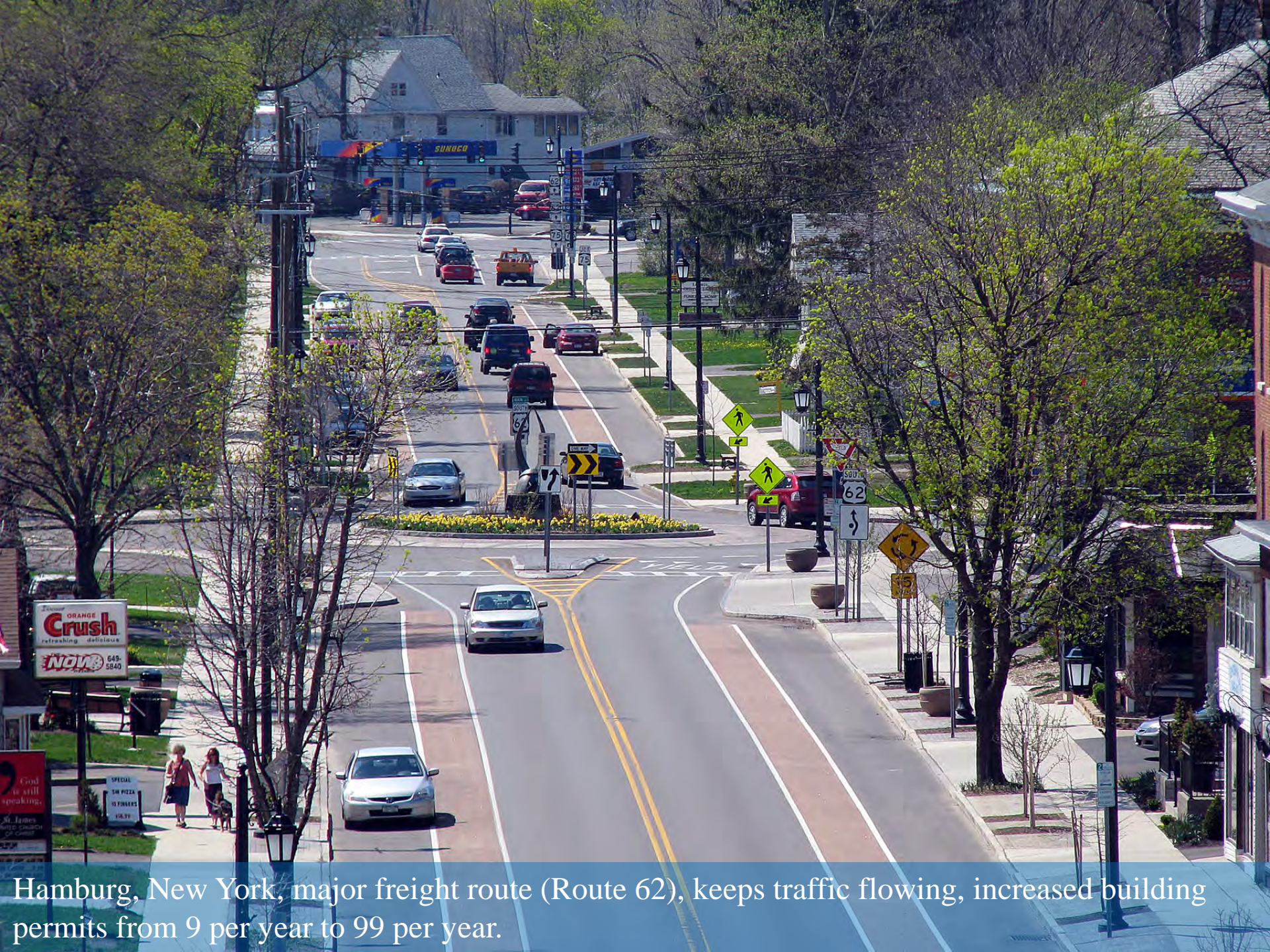
Hamburg, New York, major freight route (Route 62), keeps traffic flowing, increased building permits from 9 per year to 99 per year.