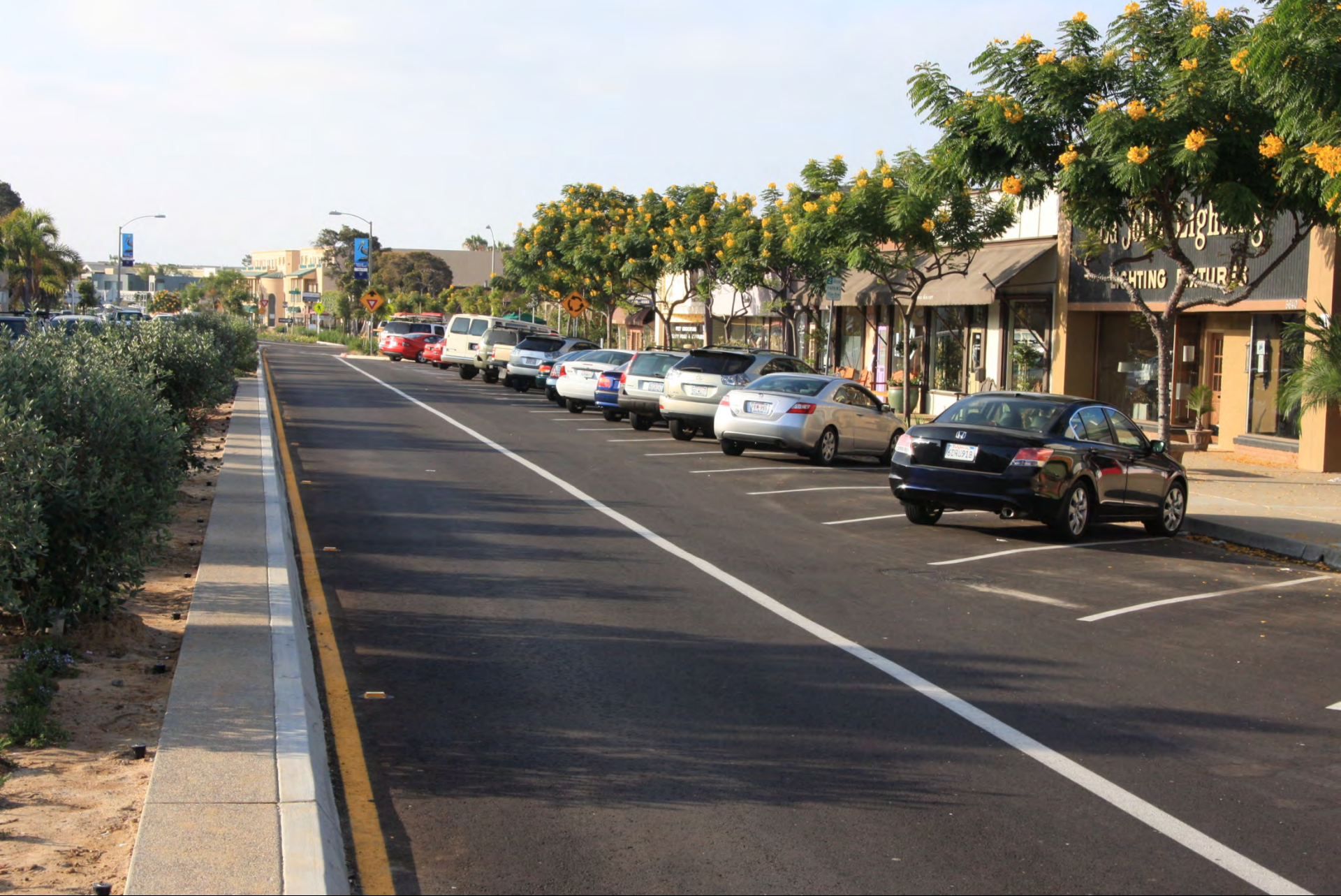
Lajolla Boulevard, Birdrock (U.S. Coastal 101), handles 23,000 ADT