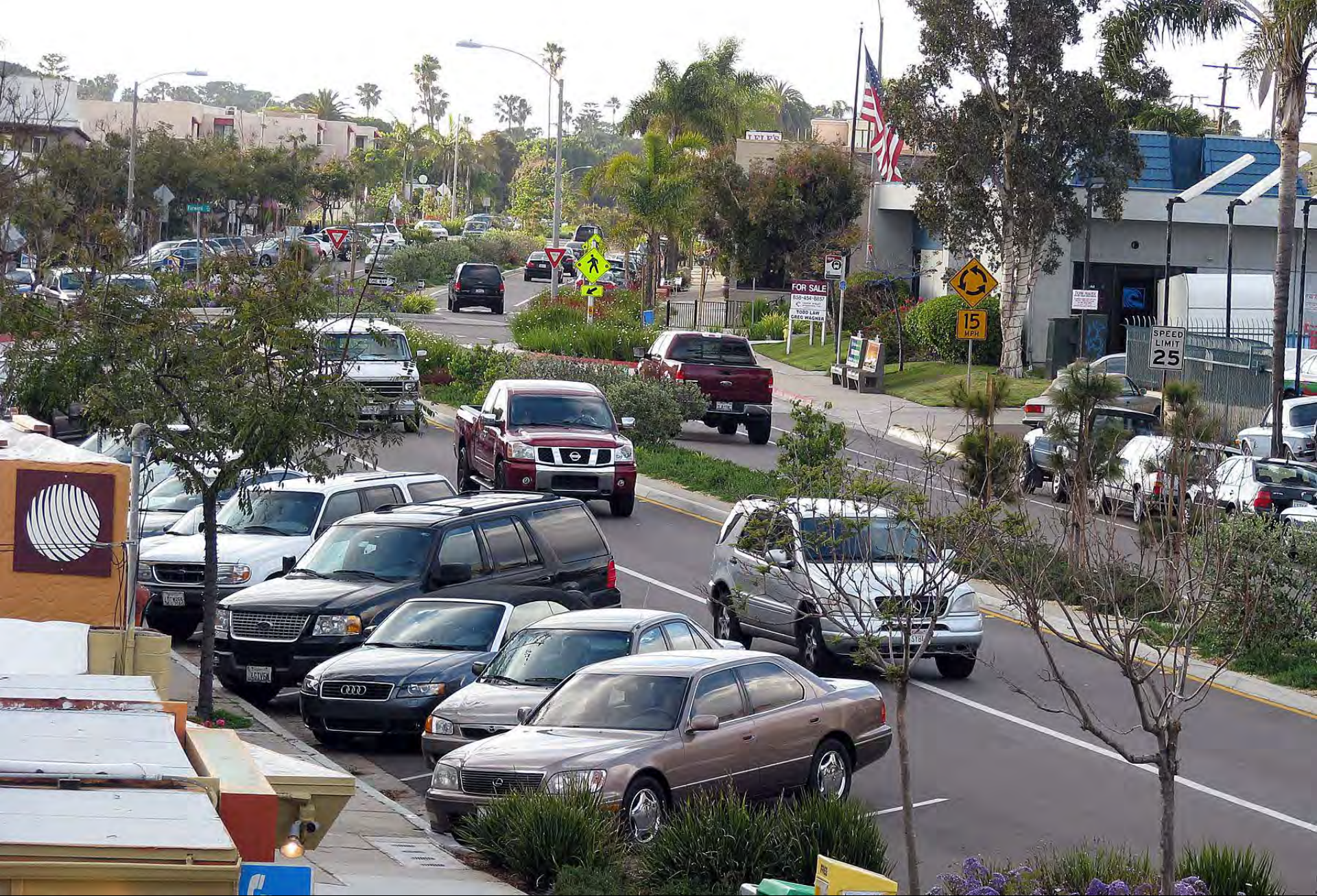
La Jolla Boulevard, Birdrock (U.S. Coastal 101), handles 23,000 ADT