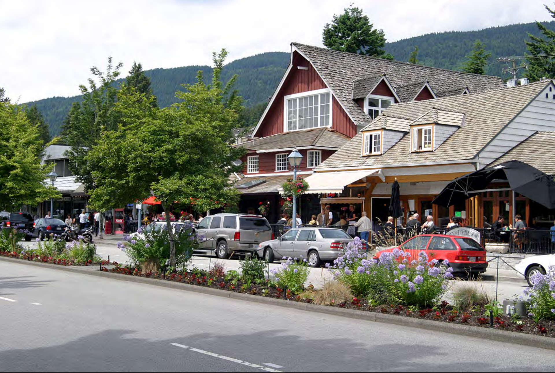
Marine Drive, Dundarave, B.C.