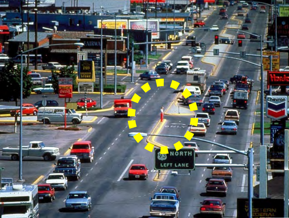
Highway 93, Missoula, Montana

There was a time when we built transportation through communities; today we build communities through transportation.