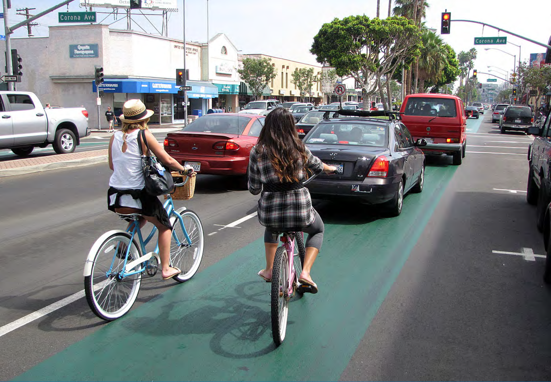
Belmont Shores, Long Beach, California (handles 43,000 ADT)