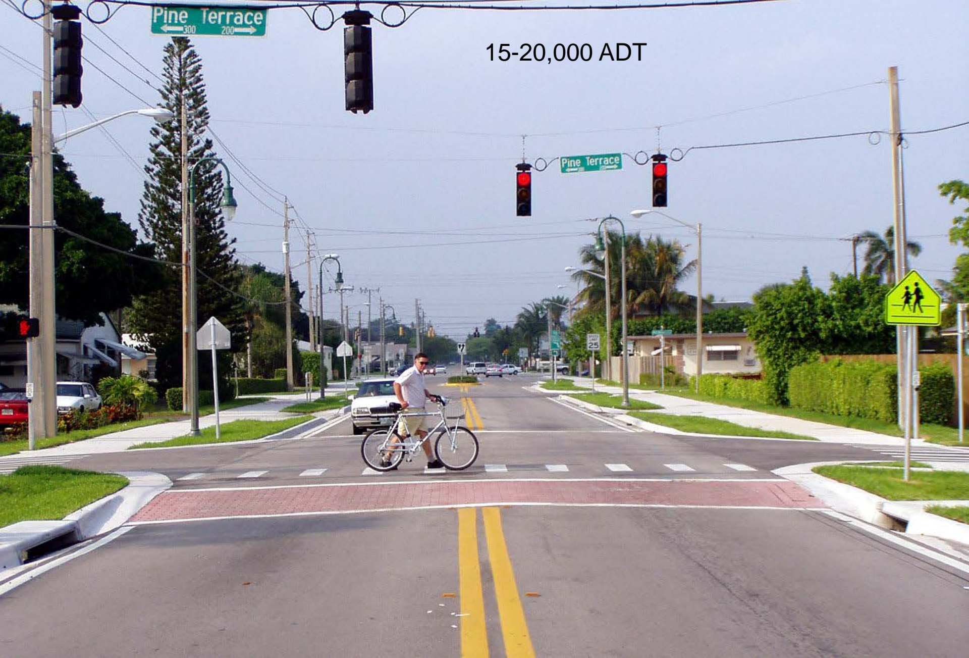
West Palm Beach, Florida