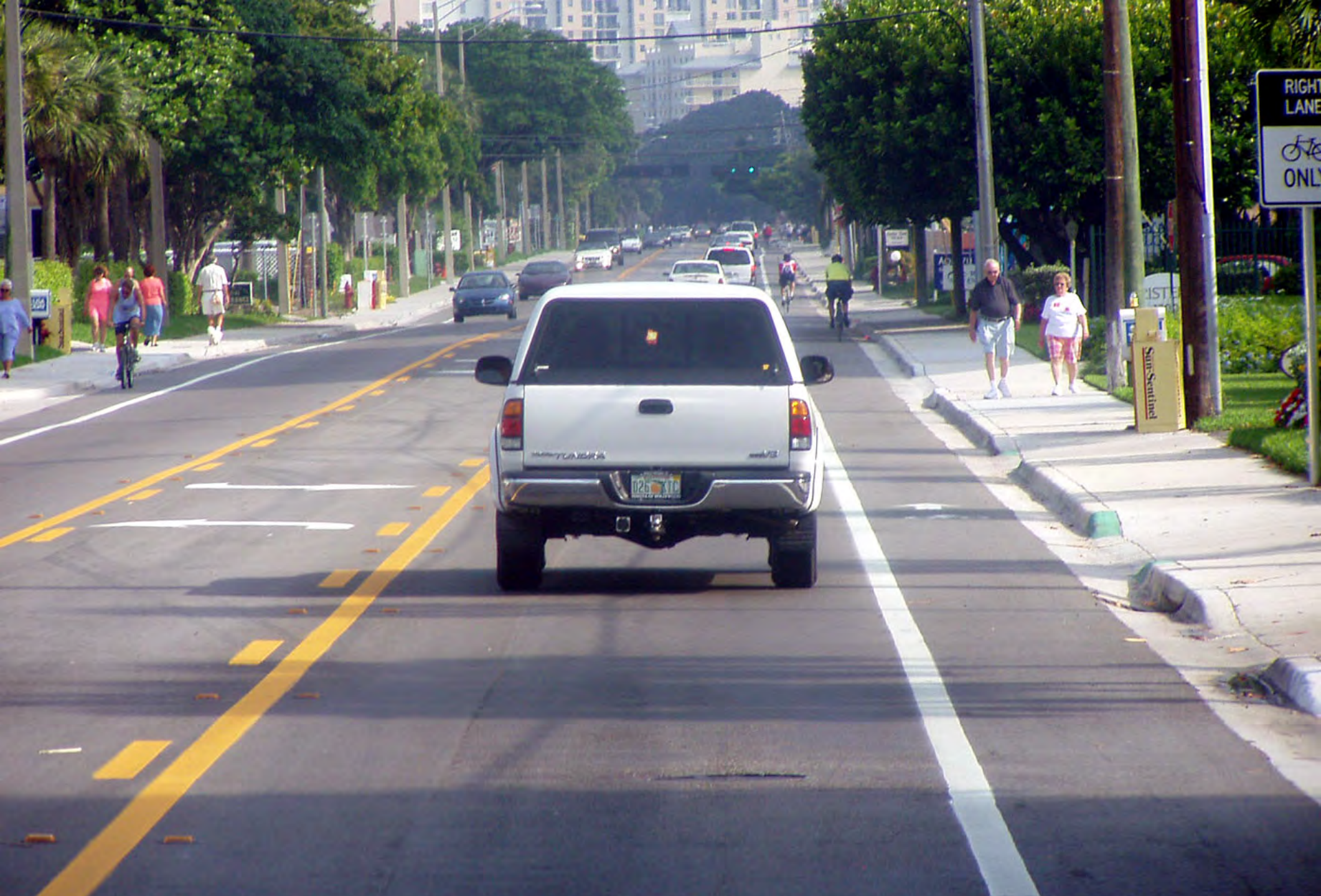
Ft Lauderdale By-The-Sea, formerly a 4-lane road, highly supports Driving, transit freight, buses, walking and bicycling.