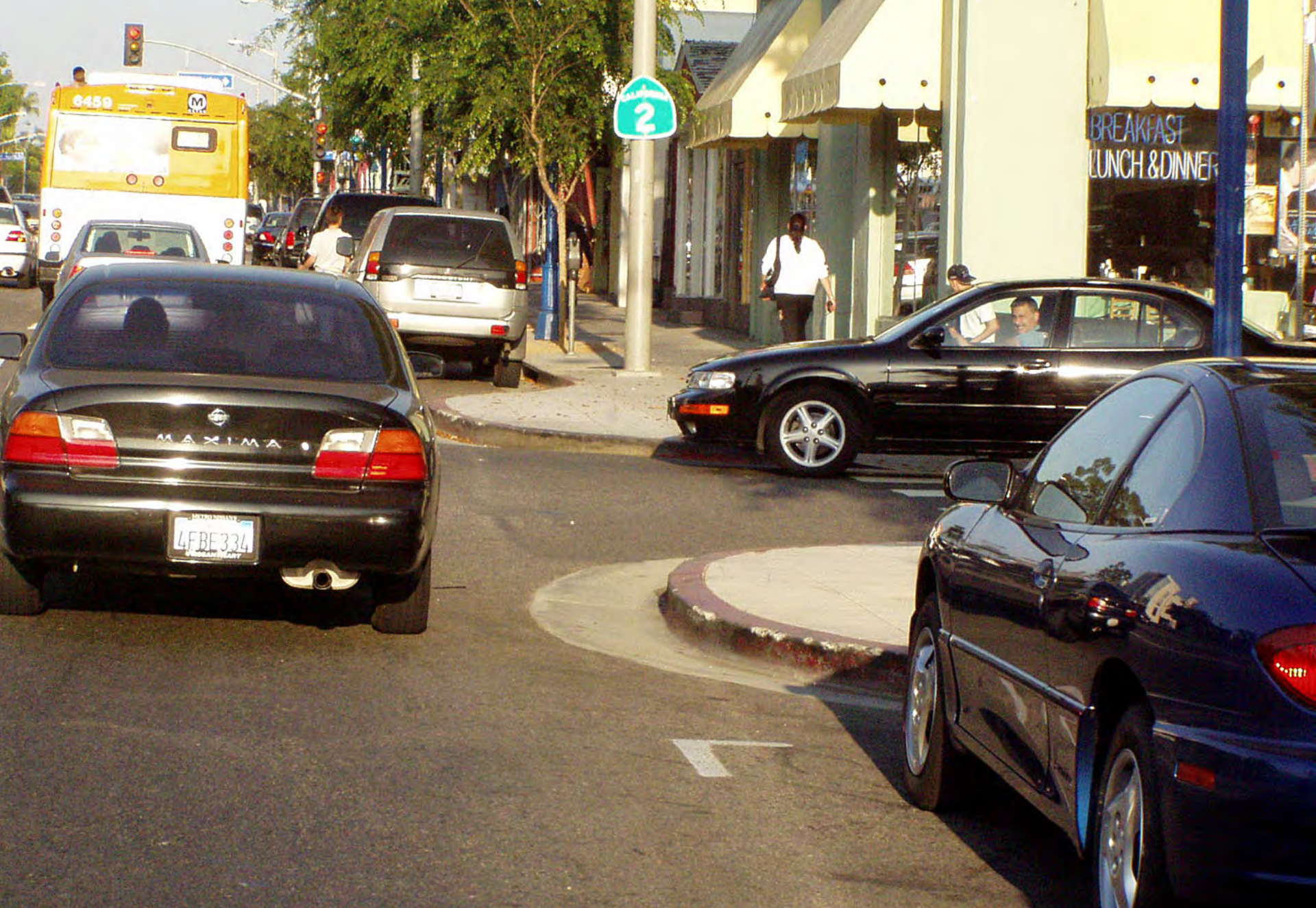
West Hollywood, CA, Santa Monica Boulevard, RT 66, ( ADT 50,000+)